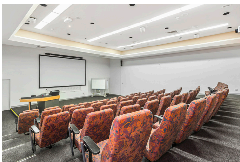
MOUNT MACEDON THEATRE