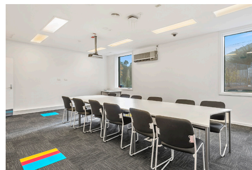
SYNDICATE 1 - KERRIE