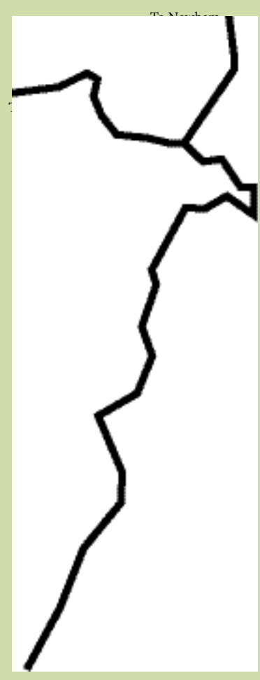
To Gisborne, Melbourne, etc